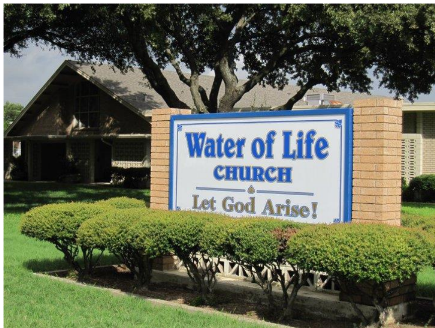
Water of Life Church – 1621 18 th Street - Plano, Texas

brought him to repentance. He retired the debt on the entire note on the building in 1985 and the ministry has been out of debt ever since. In June 1996 the Lord told him to stop taking up offerings by passing the plate and he installed a treasury box at the back of the sanctuary for people to give their offerings which remains today.