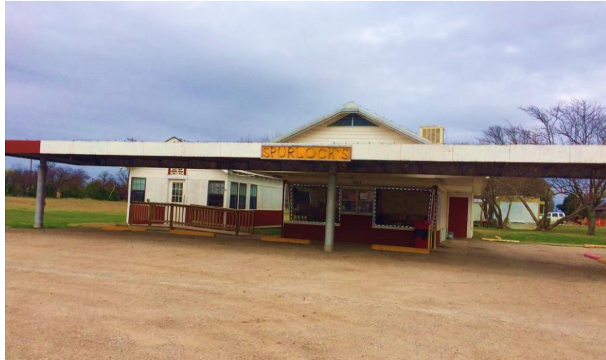
Former Dairy Queen in Anna, Texas

The next day he was on his way to a client's to look at a horse and he stopped at the Dairy Queen in Anna to get a coke. The two partners of the corporation were there and they asked him if he was interested in selling his share. As unassuming as he can be, he said, "Maybe." They made arrangements to meet that afternoon and finalize an agreement and just that quick, it was done.