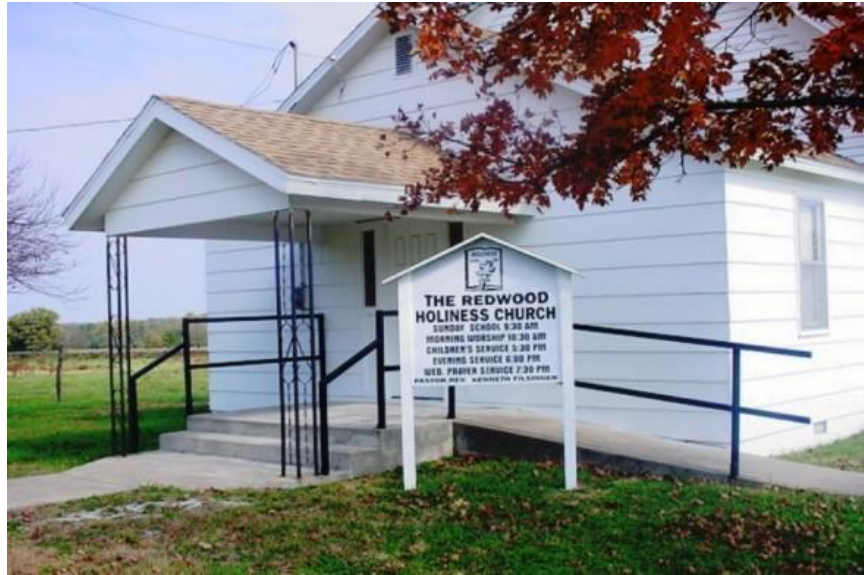
Redwood Holiness Church, Sarcoxie, Missouri